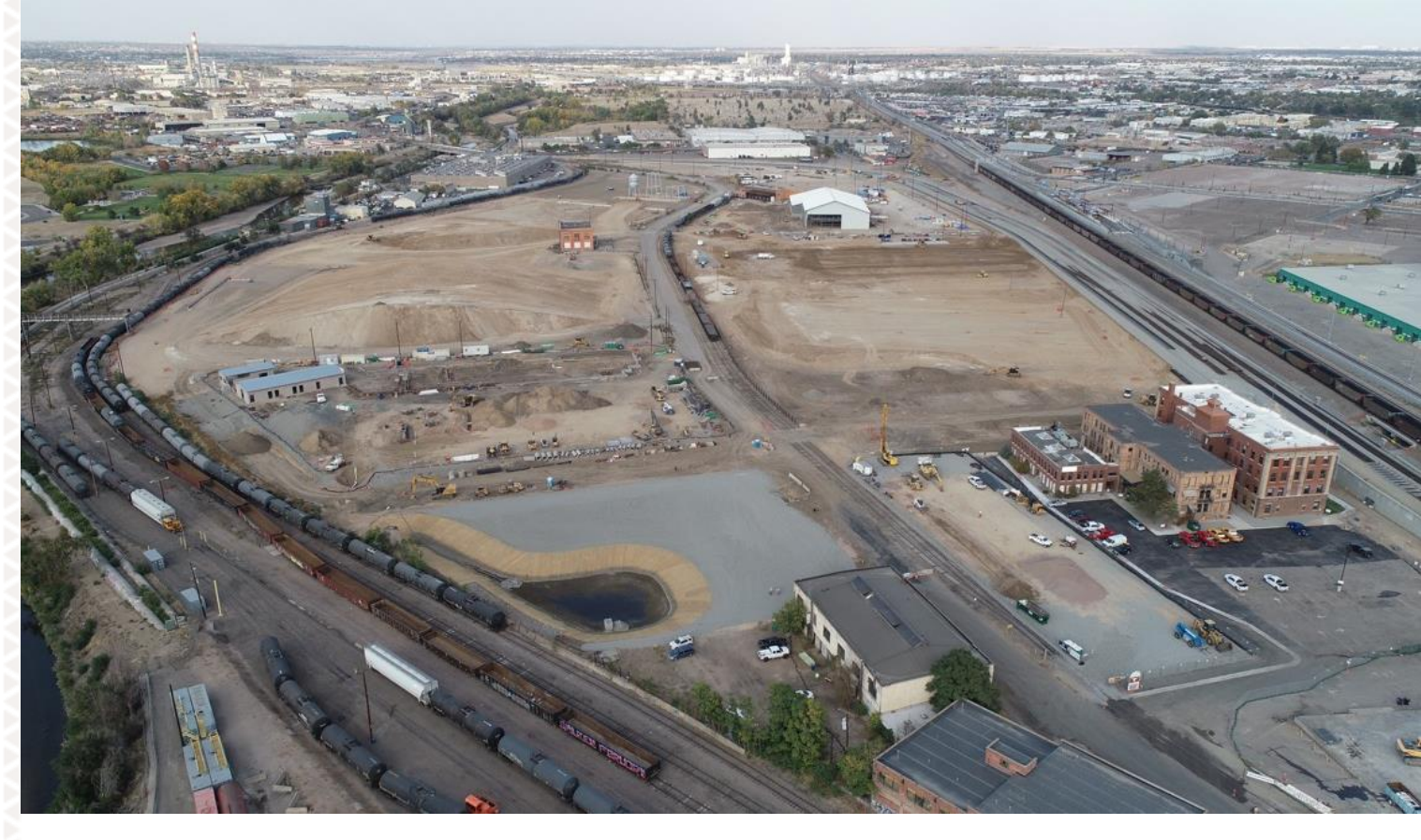
Livestock Center pad and Legacy Center pad continue to progress and are trending on schedule.